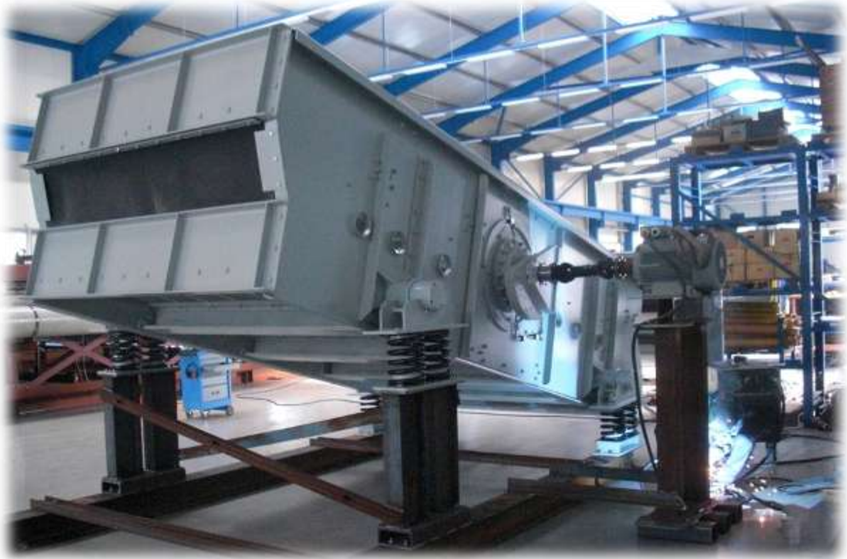
VSK-20-50-2 on the test rig