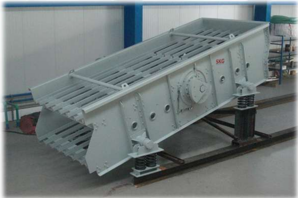
VSK-20-50-2 during final assembly