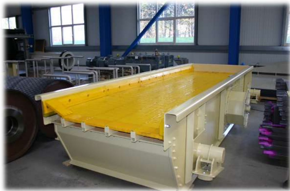
VSK-15-50-1 with PU-changing system