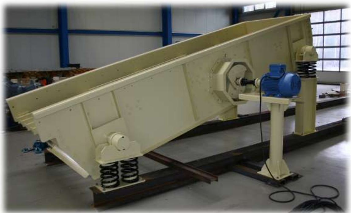
VSK-15-50-1 during final assembly