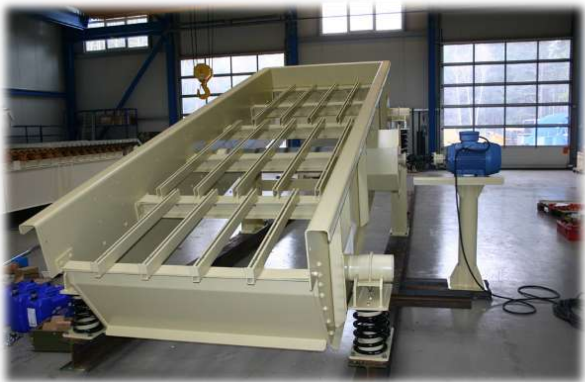
VSK-15-50-1 on the test rig