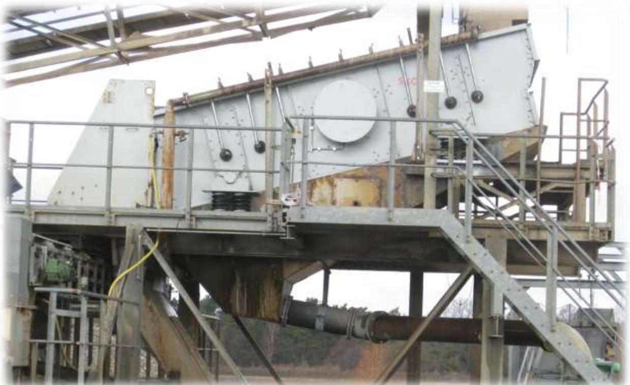
VSK-20-50-2 exchange machine installed in the existing plant